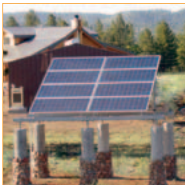
Sharp multi-purpose modules offer industry-leading performance for a variety of applications.