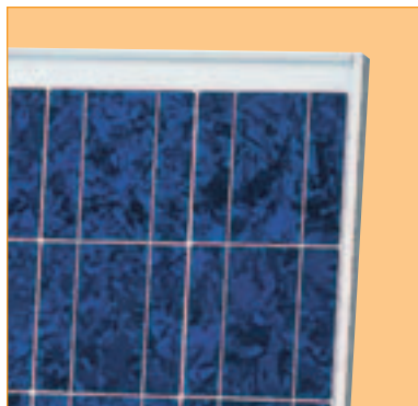
Solder-coated grid results in high fill factor performance under low light conditions.

Sharp's ND-123U1 photovoltaic modules offer industry-leading performance, durability, and reliability for a variety of electrical power requirements. Using breakthrough technology perfected by Sharp's nearly 45 years of research and development, these modules use a textured cell surface to reduce reflection of sunlight, and BSF (Black Surface Field) structure to improve conversion efficiency. An anti-reflective coating provides a uniform blue color and increases the absorption of light in all weather conditions. Common applications include RVs, cabins, solar power stations, pumps, beacons, and lighting equipment. Designed to withstand rigorous weather conditions, a junction box is also provided for easy electrical connections in the field, making Sharp's ND-123U1 modules the perfect combination of advanced technology and reliability.